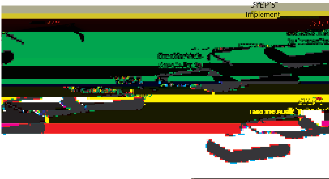
Figure 6: Step 2 of the Employee Performance Assessment and Feedback System Toolkit

Step 2 enables your organization to benchmark your responses to the Audit of your Employee Performance Assessment and Feedback System (completed in Step 1) against the findings of the National Study of Workplace Equity 1 .